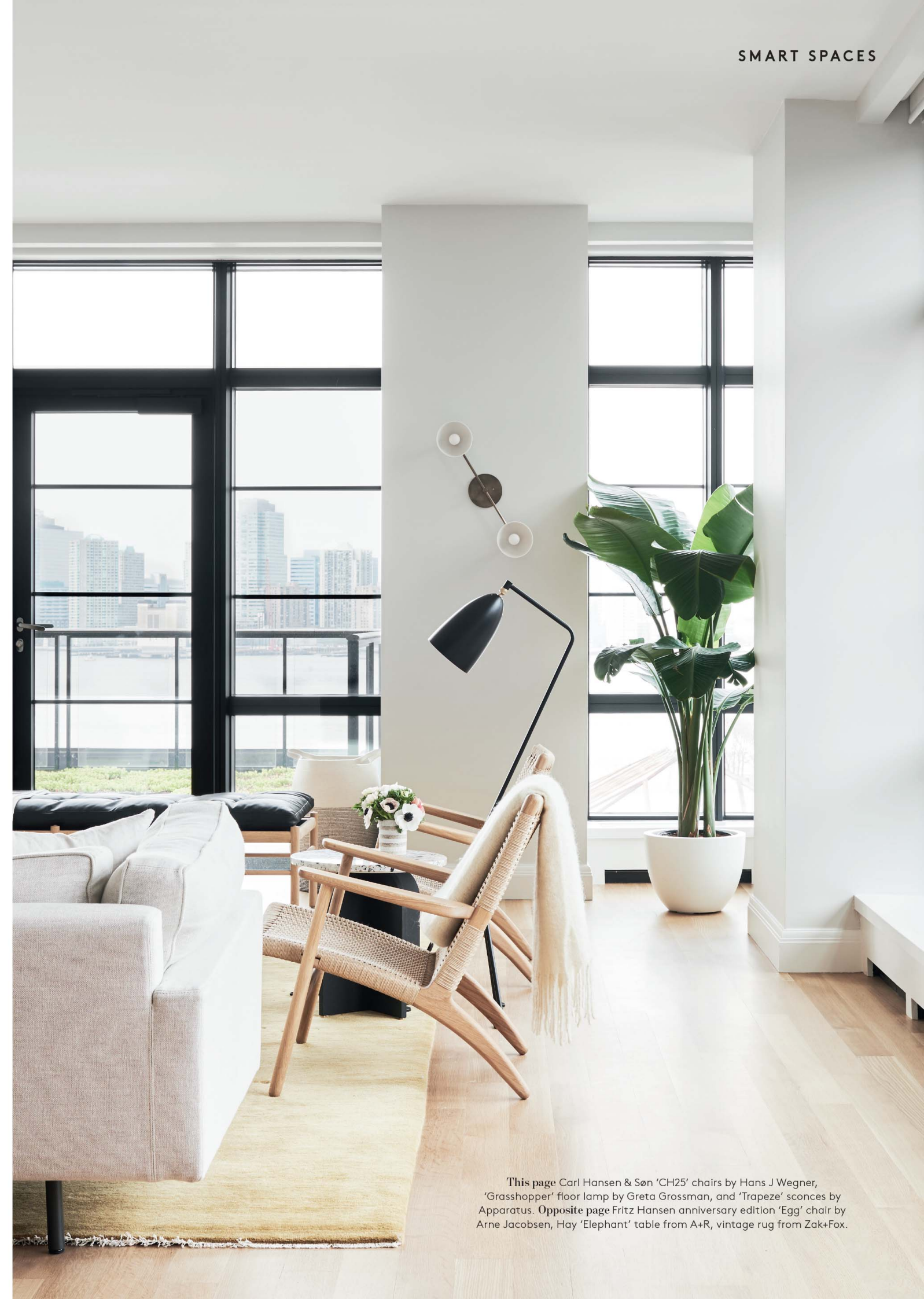
This page Carl Hansen & Søn 'CH25' chairs by Hans J Wegner, 'Grasshopper' floor lamp by Greta Grossman, and 'Trapeze' sconces by Apparatus. Opposite page Fritz Hansen anniversary edition 'Egg' chair by Arne Jacobsen, Hay 'Elephant' table from A+R, vintage rug from Zak+Fox.